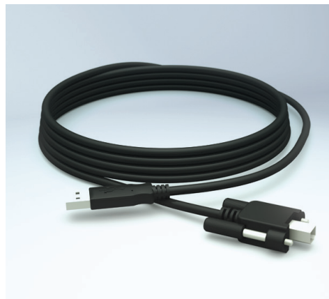
Secure USB Cable